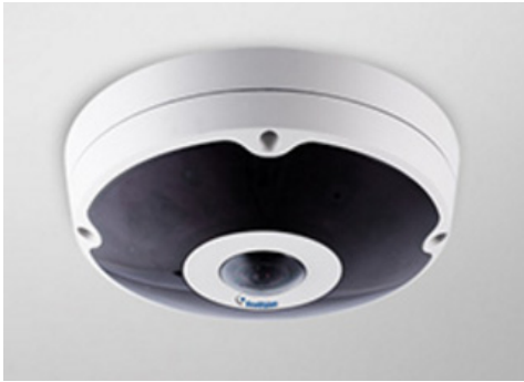
Hard Ceiling Mount (With IR LED ring)