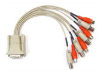
8 cam video cable